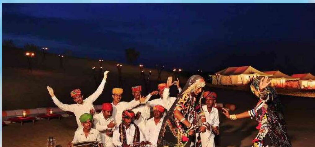
RAJASTHANI FOLK DANCE & MUSICAL EVENING